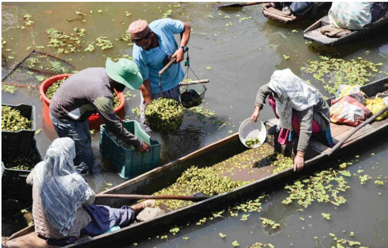
Locals collecting water chestnuts from a lake in Srinagar to be sold in the market.

During the meeting the Union Home Minister expressed grief over the loss of lives in the recent incidents. "In this hour of crisis, from the very first day, PM Modi has spoken to the Lieutenant Governor and Chief Minister of | More on P6