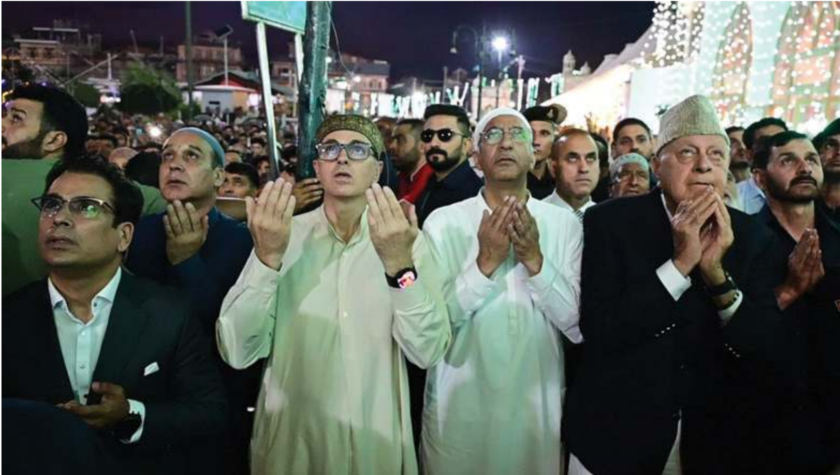
Chief Minister Omar Abdullah offers Maghrib prayers at Hazratbal shrine on Saturday.