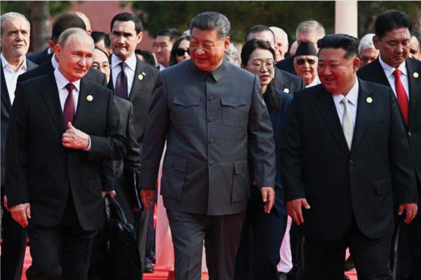
Russian President Vladimir Putin, left, Chinese President Xi Jinping, centre, and North Korean leader Kim Jong Un, right, arrive at a military parade in Beijing, China, on Wednesday

If China is unwilling to influence outcomes in Ukraine and unable to deter potential instability in its own neighborhood, that suggests there is more to Sino-Russian relations