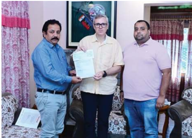
KT News Desk