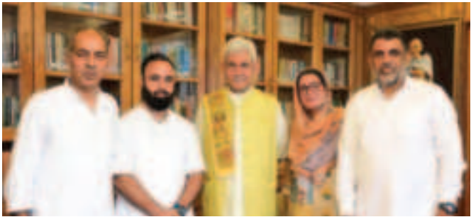
KT News Desk