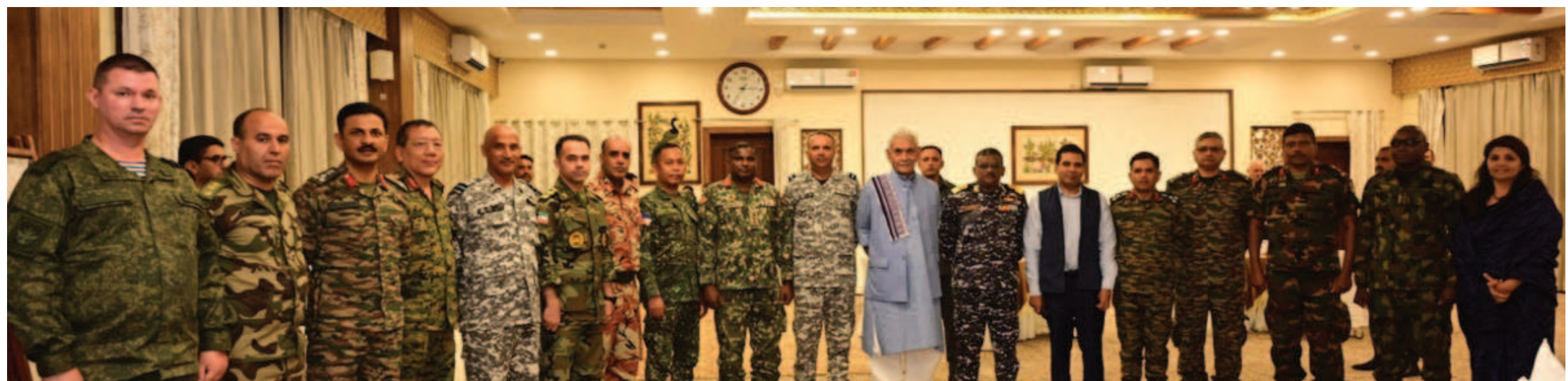
Lieutenant Governor Manoj Sinha interacts with the officers attending NDC course