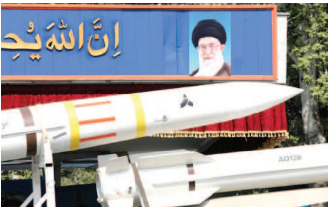
Studies who studied Iranian missile sites.