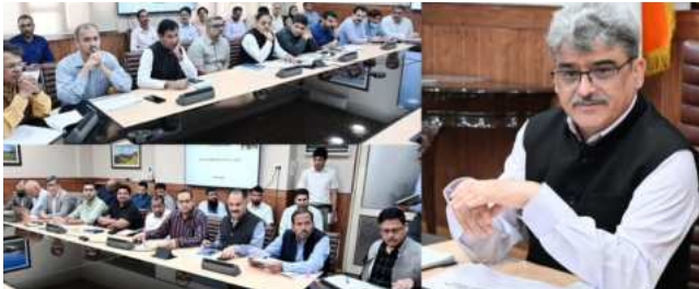
KT NEWS DESK