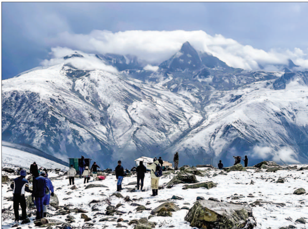
Waris Fayaz (KNO/KT)

The maximum temperature settled below normal across Union Territory with Srinagar recording a day temperature of 12.5 degree Celsius | More on P6