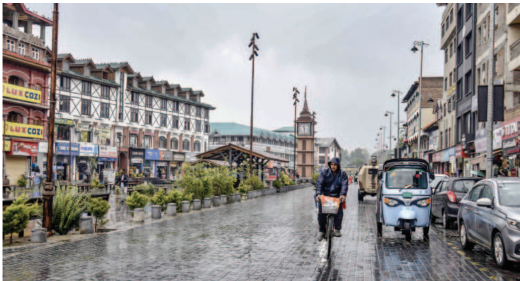
Rains lashed Kashmir plains on Monday while upper reaches recorded season's first snowfall causing temperatures to plummet below normal.