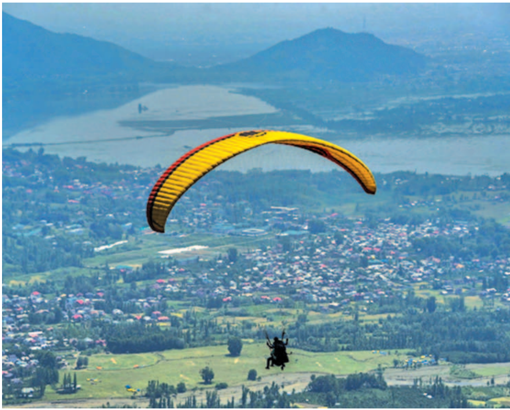
TOURISTS SOARING high above Srinagar's Boulevard, enjoying the thrill of paragliding with breathtaking views of the city and Dal Lake.

He also said the BSF has had drone capability for | More on P6