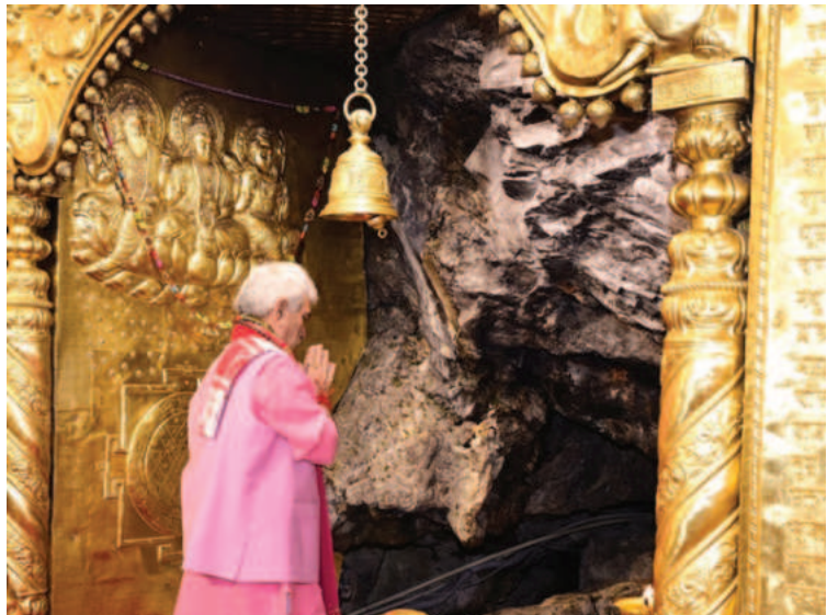
Lieutenant Governor Manoj Sinha paid obeisance at Shri Mata Vaishno Devi ji Shrine on Tuesday. He prayed for peace and prosperity of J&K UT and well-being of one and all.

Further, suppliers and potential operators are apprehensive about some of the provision of the Civil Liability for Nuclear Damage Act, 2010.