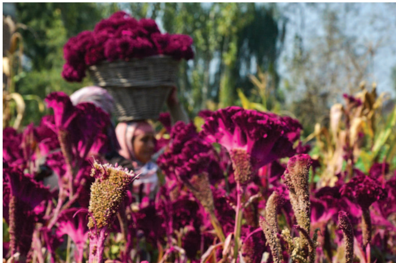
A woman carrying cockscomb flowers, locally known as Mawal, in a field in Srinagar on Wednesday October 15, 2025. This vibrant flower serves the dual purpose of an ornamental garden plant as well as a prized culinary ingredient in Kashmiri kitchens.

It also gave go-ahead for introduction of amendments in the Jammu and Kashmir Goods and Services Tax Act 2017. | More on P6