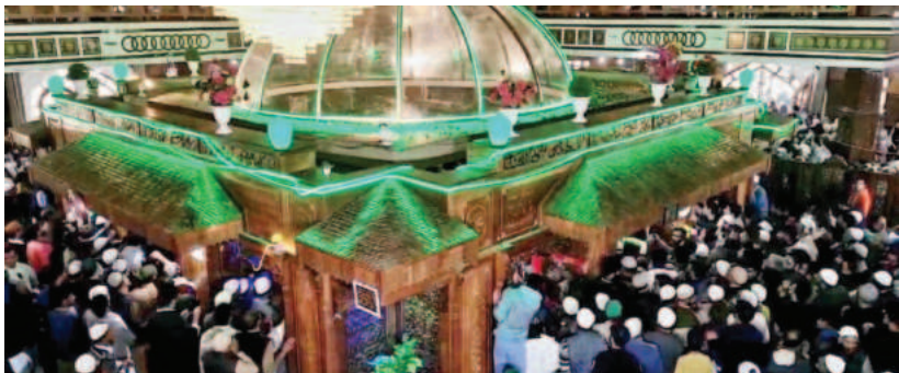
NAVEED UL HAQ

Thousands of devotees visit shrine, offer prayers for peace, prosperity