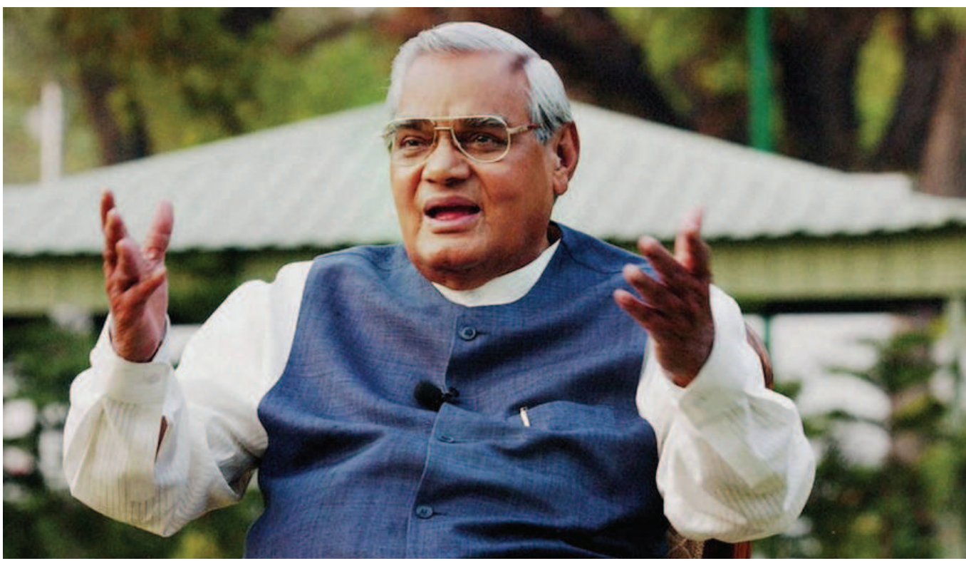
Jammu and Kashmir.

My brothers and sisters in Jammu and Kashmir, today is an opportunity when we can together heal these wounds. Together, we can participate in the creation of a happy