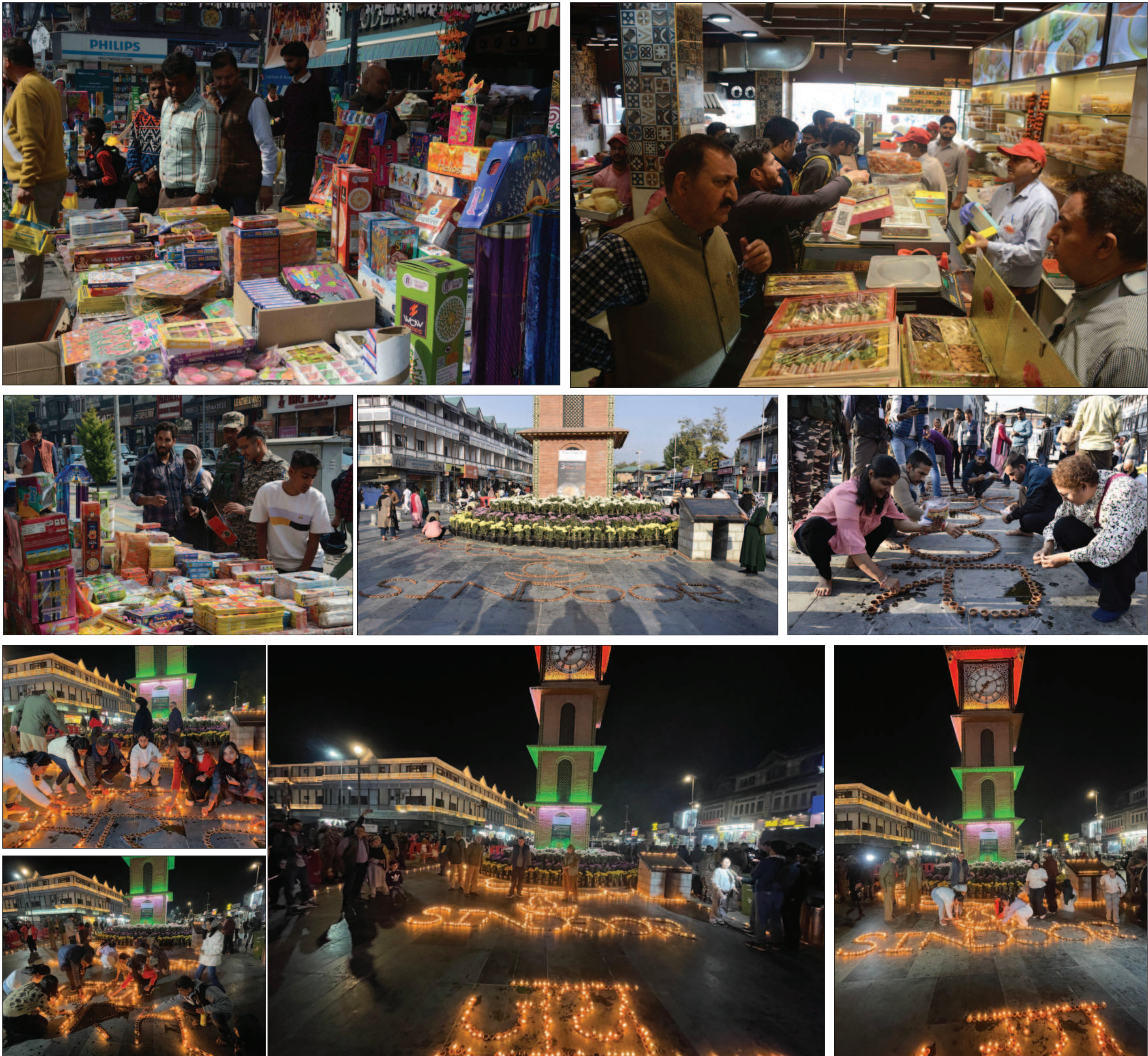
Sgr shines bright: Diwali celebrations light up hearts in J&K.