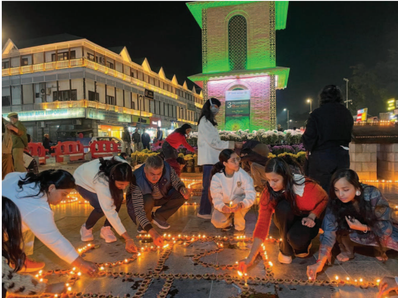
Celebrating the spirit of Diwali at Lal Chowk's historic Ghanta Ghar with lights, joy, and togetherness.