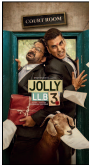
JOLLY LLB 3 (U/A 16+) HINDI - 06:55 PM

Paraguayan Miguel Almiron ($7.8 million) is in fourth place, and Mexican Hirving "Chucky" Lozano ($7.6 million) is in fifth, both notable signings for this season by Atlanta United and San Diego FC.