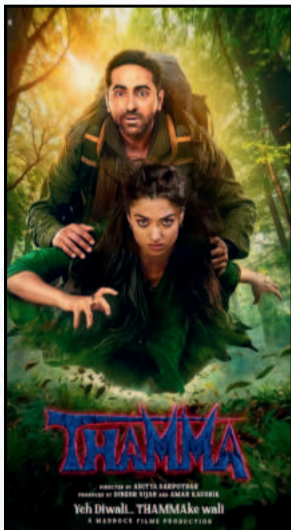
THAMMA (UA16+) HINDI - 06:40 PM