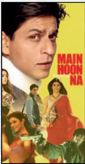
MAIN HOON NA (RE RELEASE) (UA/16+) HINDI - 03:00 PM