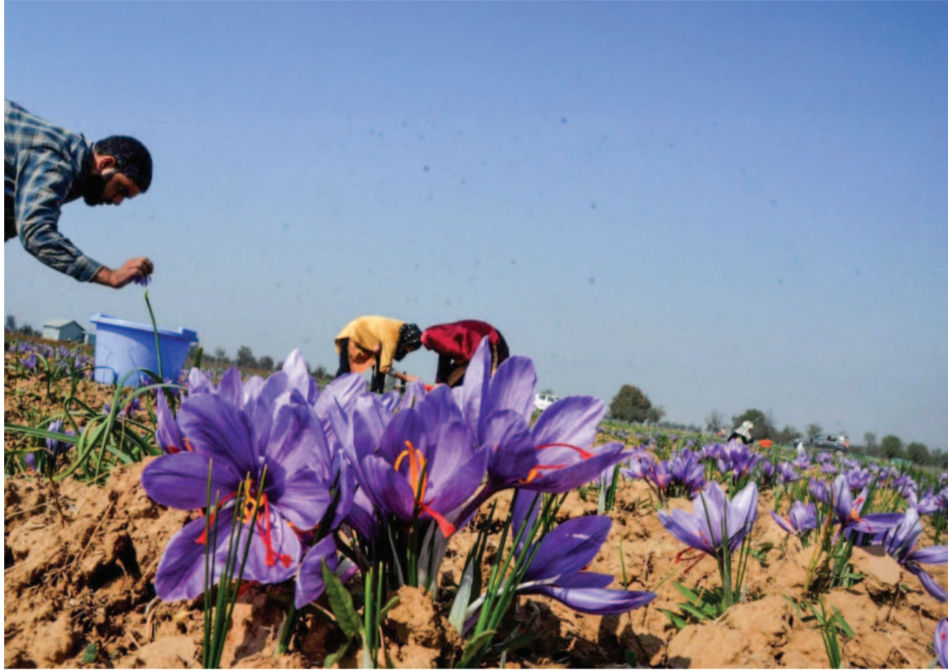
A family plucks saffron flowers at a field in Pampore

Shah said the government has delivered multiple countermeasures to cross-border terrorism, citing the surgical strikes, air strikes, and the recent Operation Sindoor. "In the past, terrorists would strike India and slip away unpunished. Now, under PM Modi's leadership, India responds inside Pakistan | More on P6