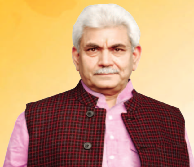
Manoj Sinha Lieutenant Governor, J&K