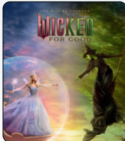
WICKED: FOR GOOD (UA 16+) ENGLISH WITH ENGLISH SUBTITLES - 10:55 AM 3D ENGLISH ATMOS WITH ENGLISH SUBTITLES 05:50 PM