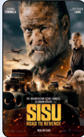
SISUR ROAD TO REVENGE (A) ENGLISH WITH ENGLISH SUBTITLES 04:45 PM