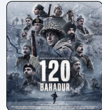
120 BAHADUR (UA 13+) HINDI ATMOS - 12:30 PM, 06:45 PM HINDI - 04:15 PM