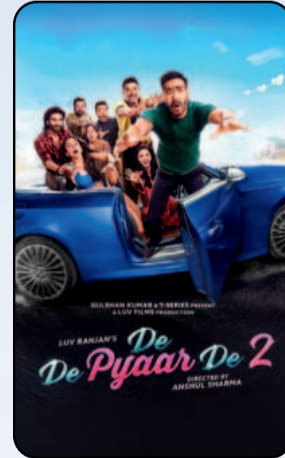
DE DE PYAAR DE 2 (U/A13+) HINDI - 01:15 PM, 07:10 PM