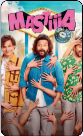
MASTII 4 (A) HINDI - 10:20 AM, 01:50 PM, 06:45 PM

Pakistan's Shumaila Kiran, with 1-10, was the best bowler while Mehreen Ali ended up with 1-45.