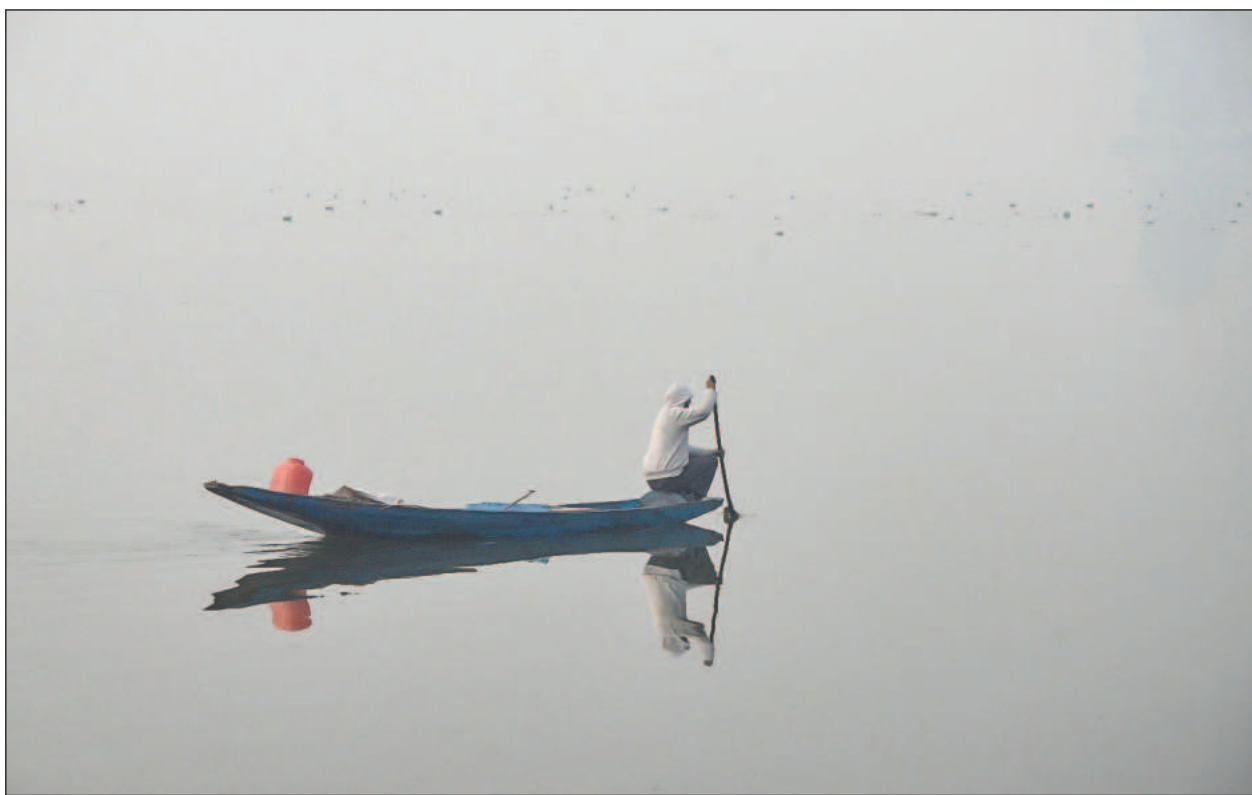
Man rows boat across mist-covered Dal Lake on chilly winter morning, as fog drifts softly through air