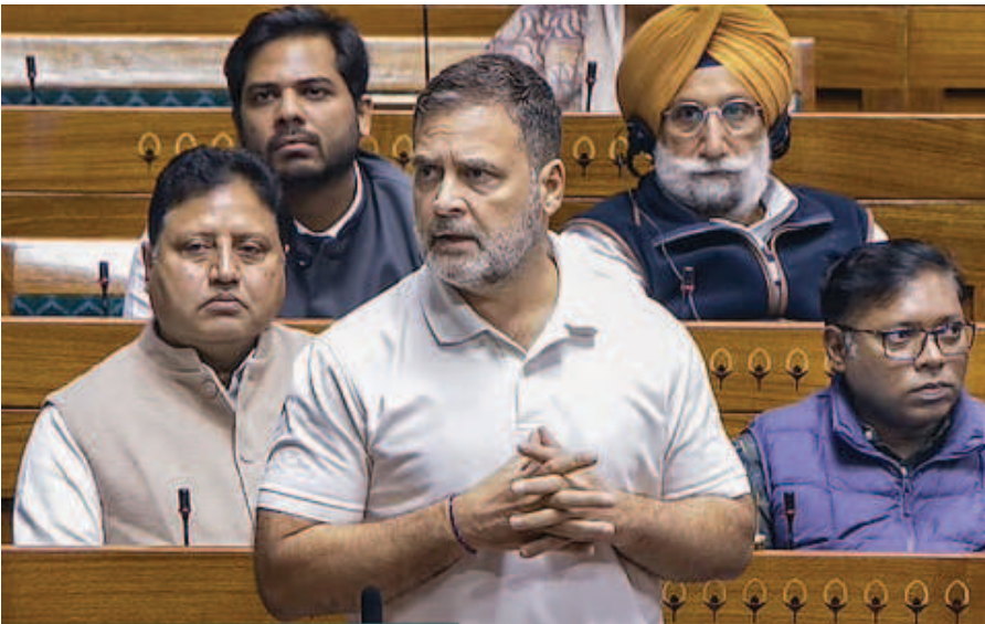
Mataram and Election Reforms."

Hitting back, BJP national spokesperson Prem Shukla said, "Rahul Gandhi says the opposition ripped the BJP members apart (dhajjiyan uda di). On the contrary, Rahul Gandhi and others in the opposition were looking away when the Congress was exposed with proof by the members of the treasury benches under the leadership of Prime Minister Narendra Modi and Home Minister Amit Shah during the debates on Vande