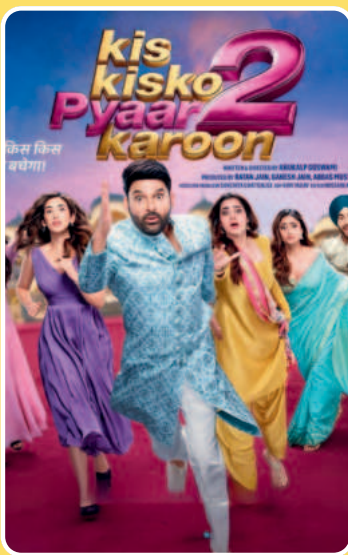
KIS KISKO PYAAR KAROON 2 (U/A16+) HINDI - 10:30 AM, 06:45 PM