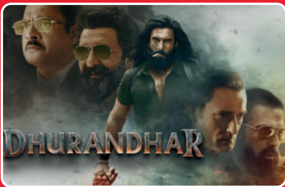
DHURANDHAR (A) HINDI ATMOS WITH ENGLISH SUBTITLES - 02:00 PM HINDI ATMOS - 06:00 PM HINDI - 10:45 AM, 04:50 PM