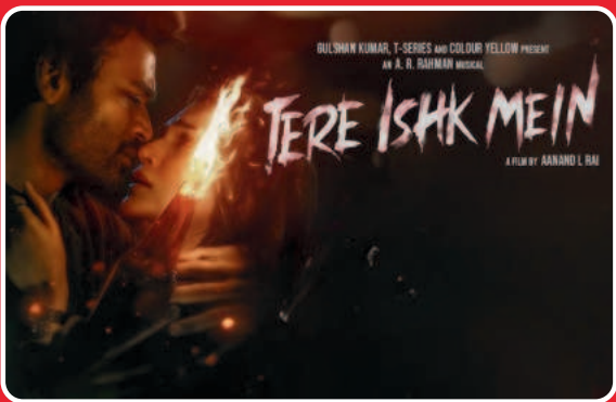
TERE ISHK MEIN (U/A, 16+) HINDI - 10:40 AM, 01:25 PM

TICKETS AT: www.bookmyshow.com | www.inoxmovies.com Paytm, Inox App, or Directly from the booking counter at the cinema.