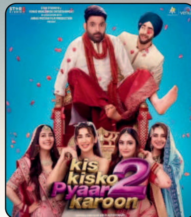
KIS KISKO PYAAR KAROON 2 (U/A16+) HINDI - 06:45 PM