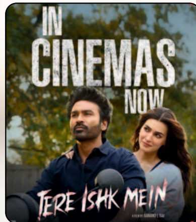
TERE ISHK MEIN (U/A 16+) HINDI - 11:00 AM