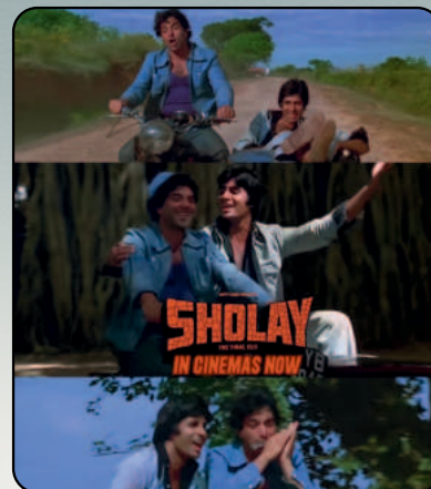
SHOLAY: THE FINAL CUT (U) HINDI - 02:45 PM

The RTI has been a thorny issue for the BCCI, which has steadfastly opposed coming under it as the Board is not dependent on government funds unlike a majority of other NSFs. In the Lok Sabha on Monday, the Minister also said that accounts of the NSFs receiving annual grant of more than Rs. 1 crore are subject to audit by the Comptroller & Auditor General (CAG) of India.