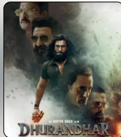
DHURANDHAR (A) HINDI ATMOS WITH ENGLISH SUBTITLES - 02:25 PM HINDI ATMOS - 10:30 AM, 04:25 PM HINDI - 12:55 PM, 05:05 PM