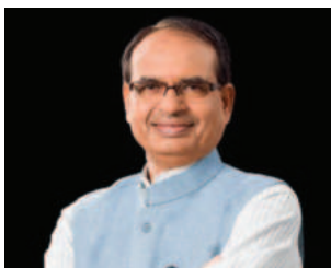
Shivraj Singh Chouhan

The new Act preserves the legal right to work, expands entitlements, strengthens worker protections, and corrects structural weaknesses revealed through years of implementation. This is not demolition, but a process of renewal grounded in experience.