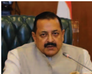
Dr Jitendra Singh

When the monsoon first touches the Deccan, a million tiny rivulets knit themselves into rivers. It is not a thunderclap that turns water into force; it is patient joining—stream to stream, village to village—until the flow is confident enough to light a city. India’s journey with the atom has felt like that: quiet channels of science converging over decades, now gathering into a river strong enough to power a data centre at midnight, sterilise a meal in the afternoon, and help a clinician save a child by evening.