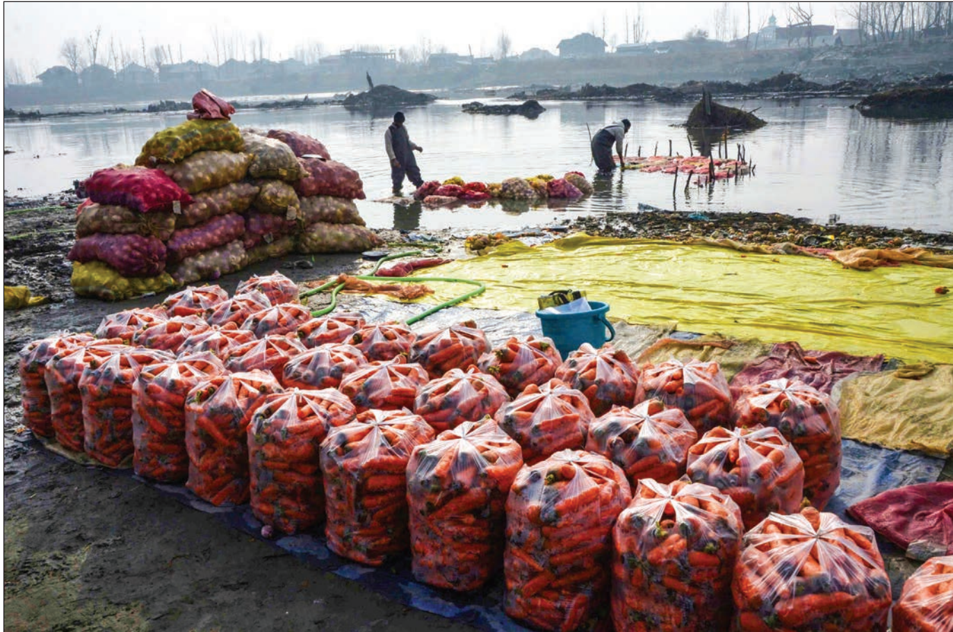
Kashmiri farmers washing and cleaning carrots along canal banks during carrot harvest season.

Authorities have advised residents and travellers, particularly in snow-bound hilly areas, to exercise caution. | More on P6