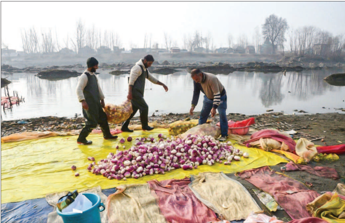
Farmers cleaning turnip during carrot harvest season.

The Lieutenant Governor said that the Jammu & Kashmir is proud to be an active participant in this | More on P6