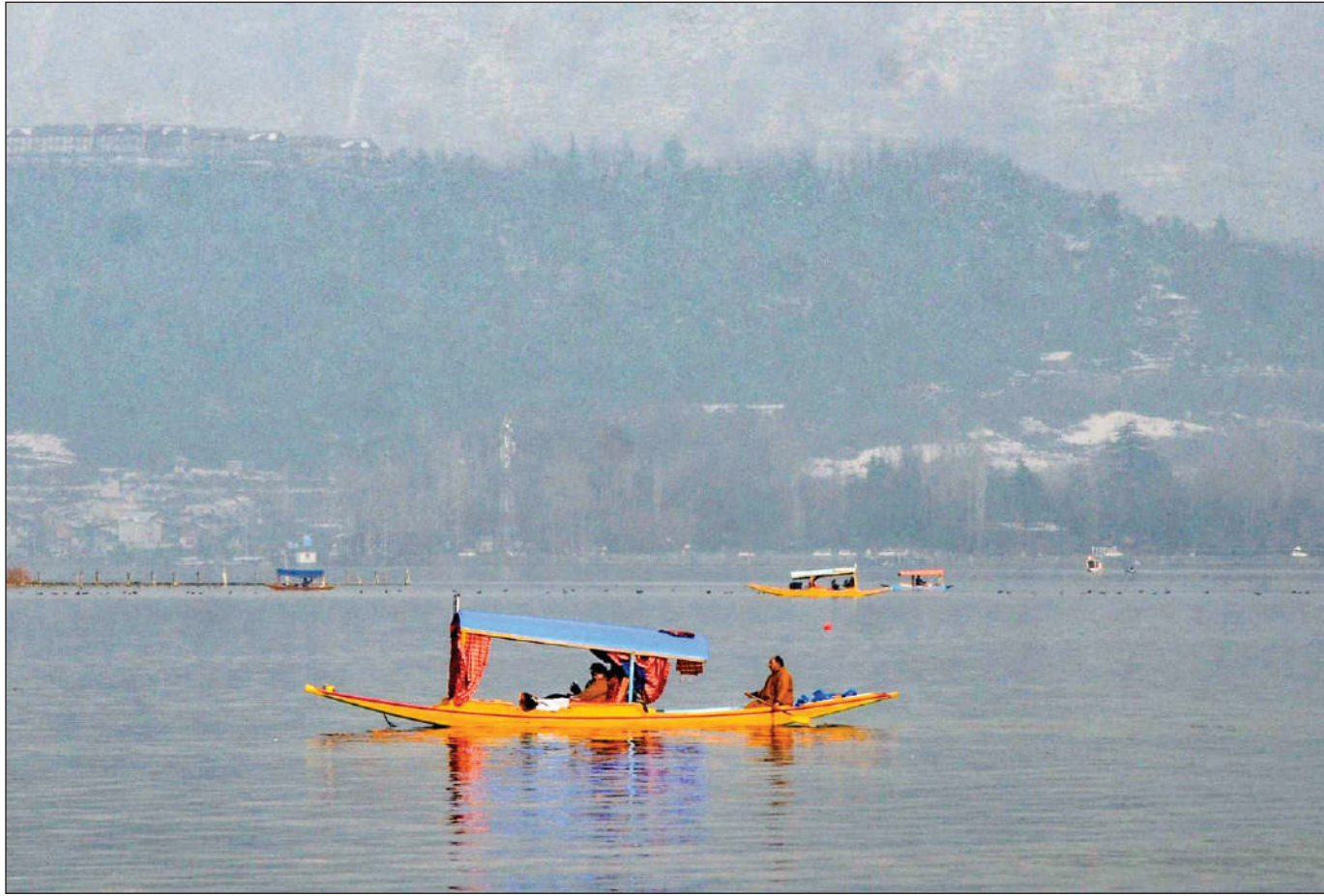
Tourists enjoying a Shikara ride in Dal Lake on Wednesday, January 28, 2026.

Yojana since its inception. "In the last year alone, around 2.5 crore poor and vulnerable citizens availed free medical treatment under | More on P6