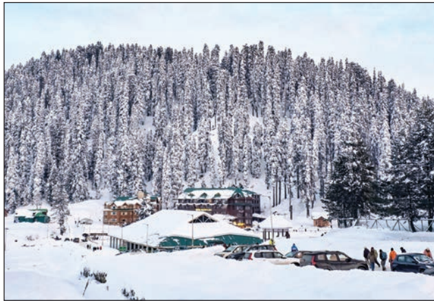
cloudy with light to moderate rain or snow at scattered to

The forecast states: "The weather from February 1 to 2 is expected to be generally