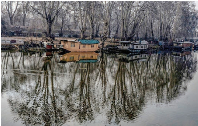
Jahangir Shah (KNO/KT)

According to the details available with the news agency—Kashmir News Observer (KNO) Srinagar recorded a minimum temperature of 1.3 degrees Celsius, while the city's airport registered minus 1.2 degrees Celsius. Tourist resorts Gulmarg and Sonamarg were among the coldest places, recording minus 9.0 degrees Celsius and minus 10.6 degrees Celsius, respectively.