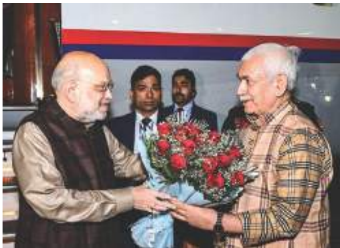
Lieutenant Governor Manoj Sinha welcomes Union Home and Cooperation Minister Amit Shah on his arrival at Jammu Airport on Thursday

“On Friday the Union Home Minister will first inspect areas under the jurisdiction of Border Outpost (BOP) Gurnam at 11:10 AM. He will then visit Border