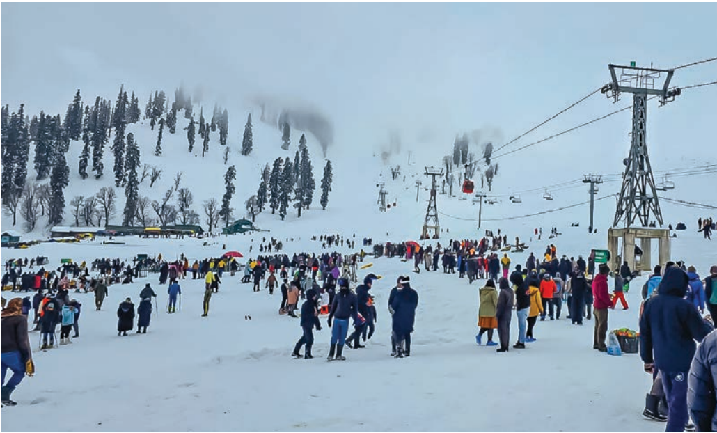
WINTER RUSH: A large crowd of tourists throngs the snow-covered slopes of Kongdoori (Phase 1) in Gulmarg.

Residents of snow-bound areas have | More on P6