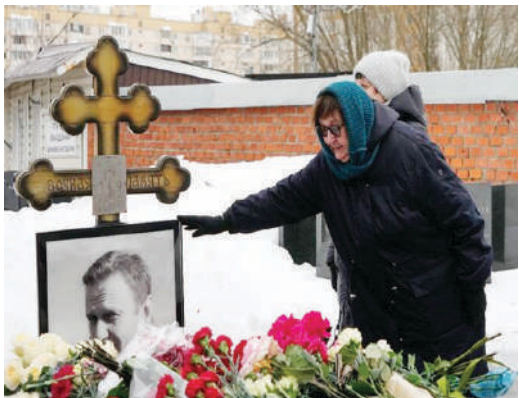
Late Russian opposition leader Alexei Navalny's mother Lyudmila Navalnaya touches his portrait at his grave, two years after his death, at the Borisovskoye Cemetery in Moscow, Russia.

"This confirms what we knew from the very beginning. We knew that our son did not simply die in prison, he was murdered," she told reporters including AFP from near his grave in Moscow on the second anniversary of his death. "I think it will take some time, but we will find out who did it. Of course, we want this to happen in our country, and we want justice to prevail."