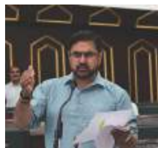
"During the current financial year 2025-26, playfields have been developed in the constituency including construction and upgradation of playground at HS Lohai with an allotted cost of Rs 5.48 lakh and construction of Synthetic Volleyball Court at Government HSS Dhar Dugnoo with an allotted cost of Rs 8.81 lakh", informed the Deputy CM.

He said that the department has already distributed 149 sports kits in different schools and clubs in the said constituency. He added that the department also conducts trail/selection camps and talent hunt programmes at school and zone level on a regular basis.