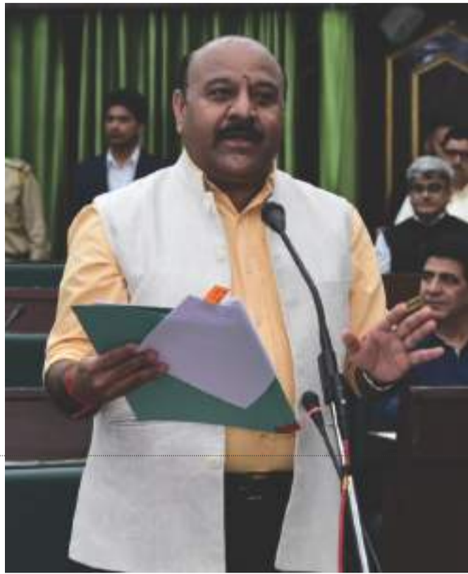
Mining Rules, 2016, along with Pollution Control Committee guidelines, to curb illegal mining and ensure smooth operation of stone crushers across the UT. He added that the

The Deputy Chief Minister stated that the department has taken necessary measures under current rules and provisions of the Jammu & Kashmir Minor Mineral Concession, Storage, Transportation of Minerals and Prevention of Illegal