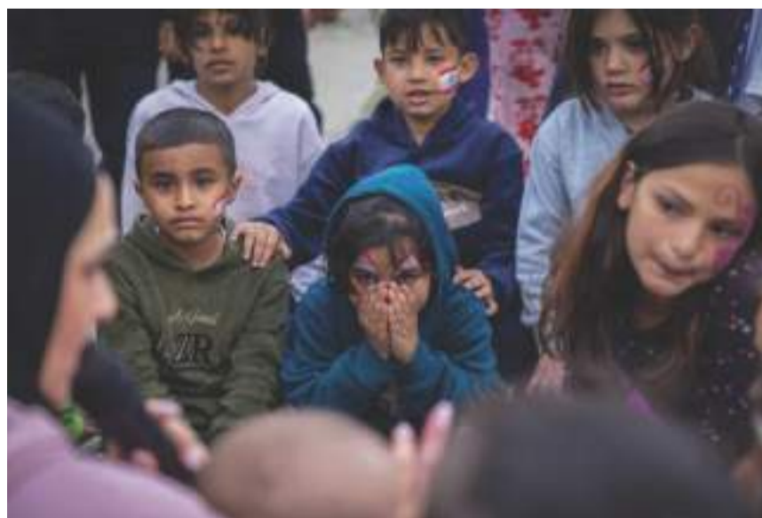
A volunteer sings for children, at a temporary encampment for displaced people, in Beirut, Lebanon.

In Iran, the country is mourning the deaths of more than 100 girls killed in a strike on a school in Minab. In Israel, Lebanon, and elsewhere, families are grieving children who had no role in this war, yet have paid the ultimate price.