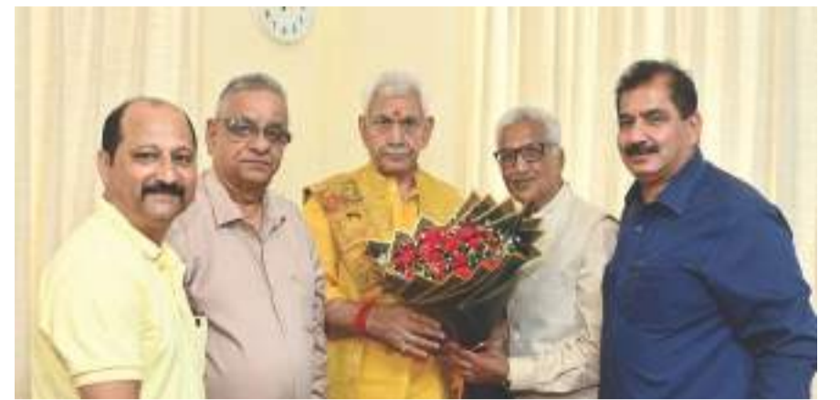
Shiv Mandir Charitable Trust delegation meets LG Manoj Sinha in Jammu

Traffic control units across Jammu, Srinagar, Ramban, Udhampur, Kishtwar, and Kargil have issued helpline numbers for real-time updates, and commuters have been advised to check road status before undertaking any journey—(KNO)