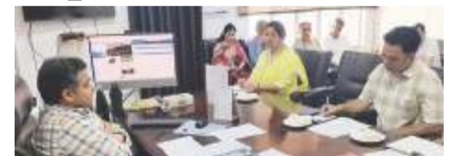
KT NEWS DESK

Jammu, Apr 06 : The J&K Information Technology Department today held a review meeting under the chairmanship of its Secretary to assess and strengthen the Union Territory's digital infrastructure, with emphasis on cloud services (Meghraj) and cybersecurity.