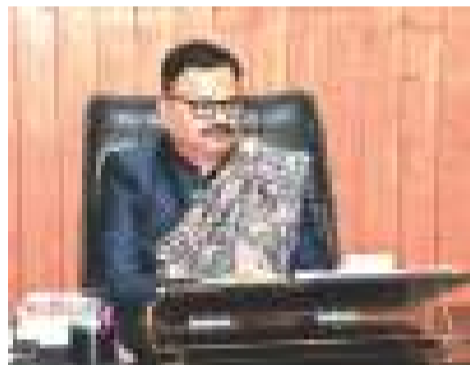
KT NEWS DESK