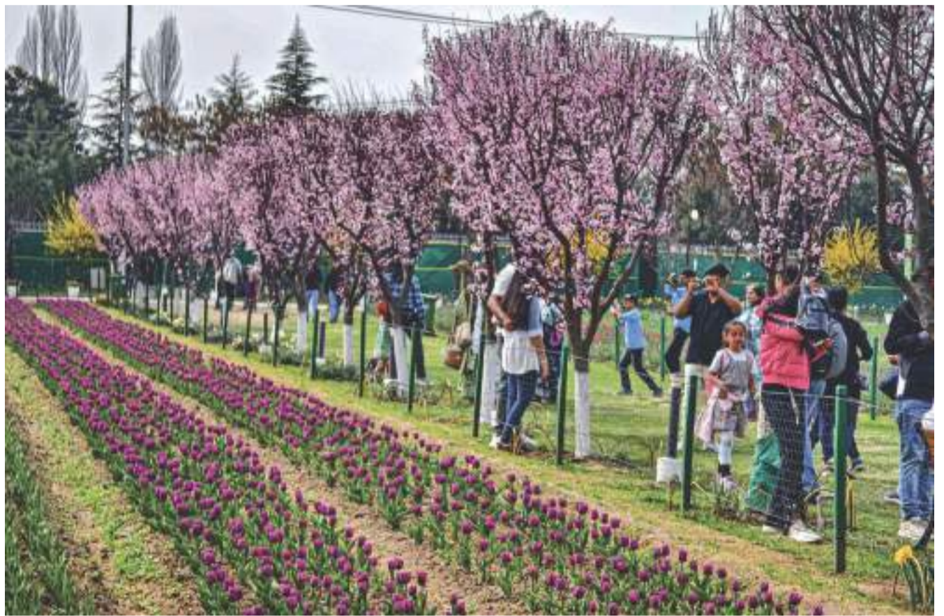
Blooming tulips in the Indira Gandhi Memorial Tulip Garden in Srinagar

except from the peak hours. Pertinently, KNO in March reported that from the upcoming financial year 2026-27, Jammu and Kashmir will likely require 3813 MWs of power | More on P6