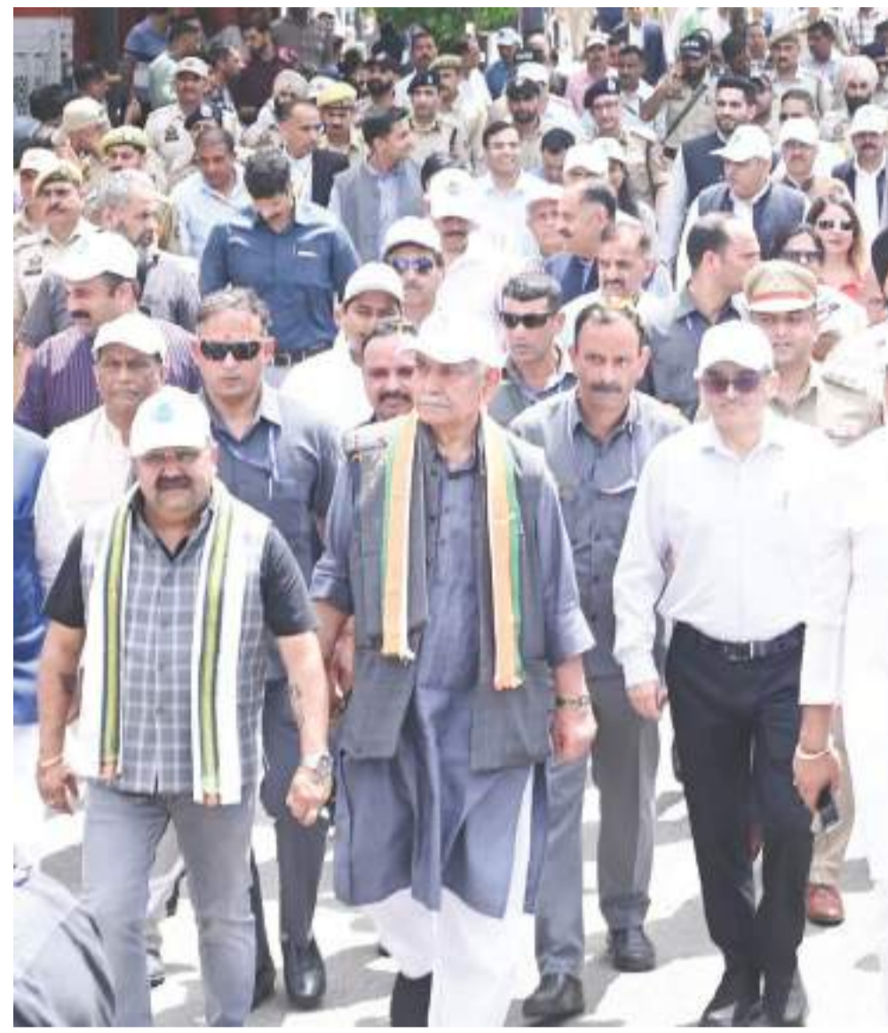
Lieutenant Governor Manoj Sinha flags off Padyatra from MA Stadium Jammu on Saturday as he launches historic mass movement for drug-free Jammu &amp; Kashmir

In a stern warning, the Lieutenant Governor stated that Drug Smugglers' assets will be seized, ringleaders prosecuted, and punishment will be delivered swiftly. "We have issued a new SOP against drug traffickers. Under this SOP, we have taken a crucial decision to | More on P6