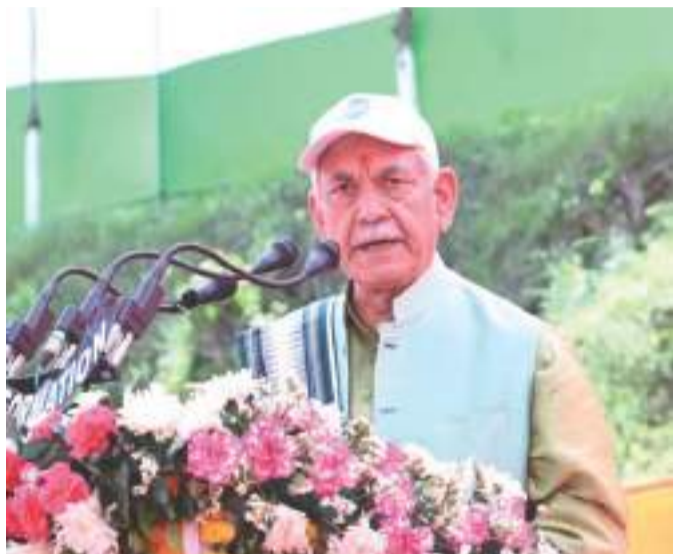
Intensifying the crusade against drug menace, the Lieutenant Governor led the Padyatra from District Police Line to District Administrative

"I urged for 'Whole of Government' and 'Whole of Society' approach. I believe when the government's strength and society's resolve act as one, then even the toughest challenges crumble," he added.