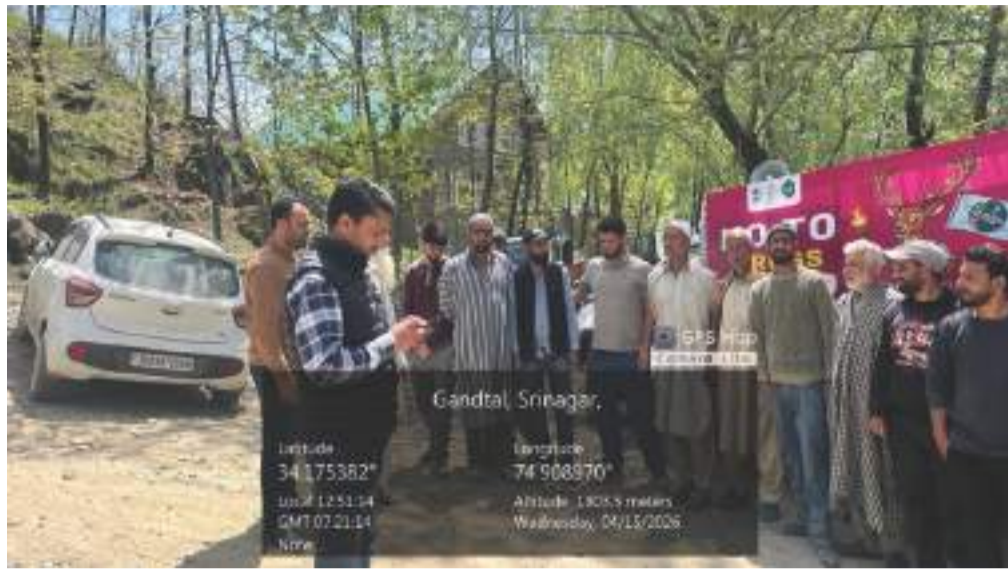
by the Information Department in collaboration with Rural Development Department,

reflects a proactive approach to reach communities at their door-steps. The use of audio messaging