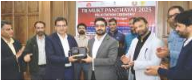
Hall of the DC Office Complex.

The machines were formally handed over to the Medical Superintendents of Super Speciality Hospital, Children Hospital and District Tuberculosis Office Srinagar in a function held here at Meeting