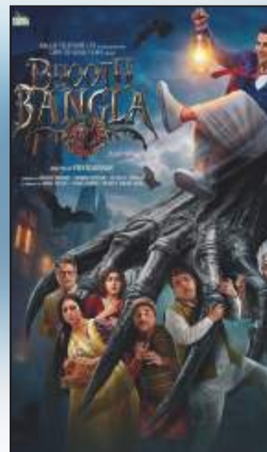
BHOOTH BANGLA (U/A16+) HINDI ATMOS - 05:15 PM, 06:30 PM