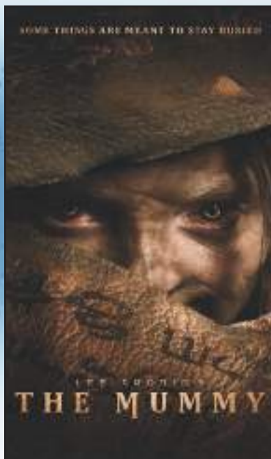
LEE CRONINS THE MUMMY (A) ENGLISH WITH ENGLISH SUBTITLES 07:20 PM