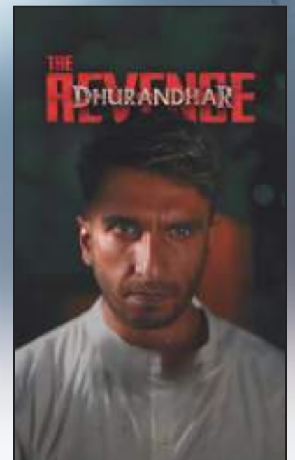
DHURANDHAR THE REVENGE (A) HINDI ATMOS - 02:55 PM, 05:00 PM

TICKETS AT: www.bookmyshow.com | www.inoxmovies.com Paytm, Inox App, or Directly from the booking counter at the cinema.