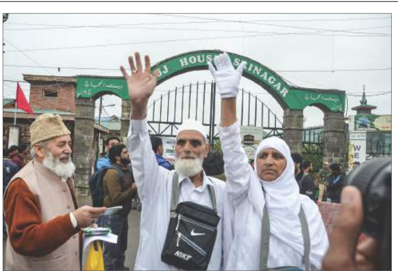
Pilgrims bidding adieu outside Haj House, Srinagar before leaving for Mecca for pilgrimage on Saturday

LG Sinha also highlighted that prevention | More on P6