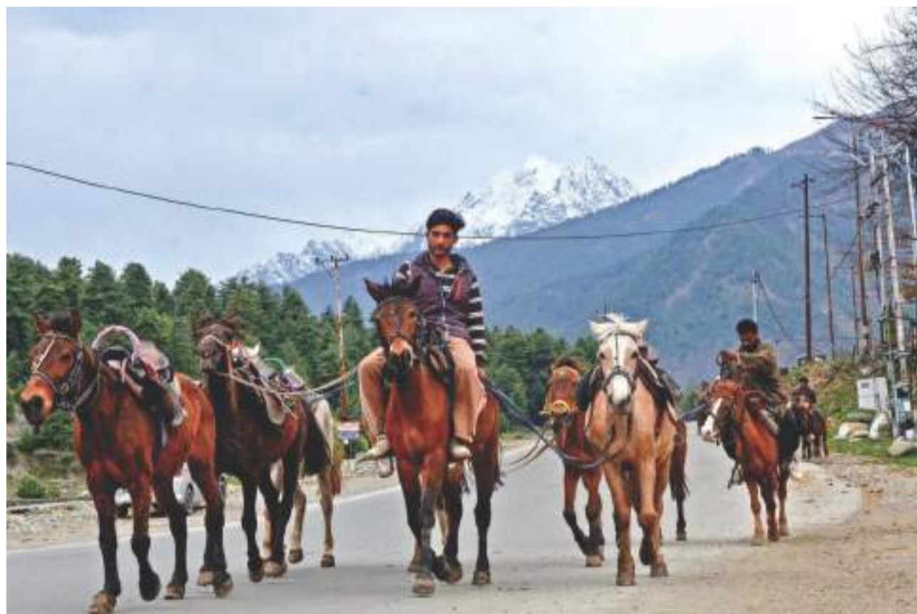
Horsemen riding their horses in renowned tourist destination, Pahalgam in south Kashmir.

The industry delegation also expressed gratitude to the Chief Minister for restoring the Darbar Move, noting that the session has significantly invigorated economic activity in the region, particularly across markets, rental properties, hotels and the