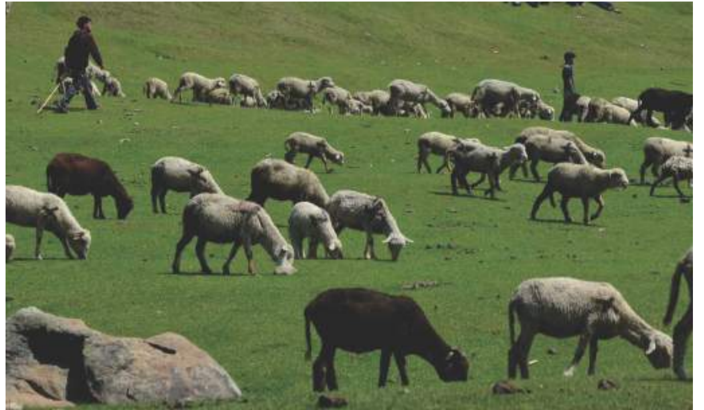
A herd of sheep grazing in the lush green meadows of central Kashmir's Budgam district.