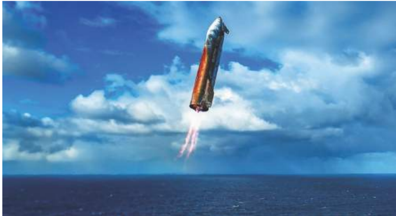
SpaceX's Starship just before splashdown on Flight 10. The vehicle's discoloration is due in part to testing of its thermal protection system. Credit: SpaceX

George Nield and Oscar Garcia SpaceX's Starship just before splashdown on Flight 10. The vehicle's discoloration is due in part to testing of its thermal protection system. Credit: SpaceX