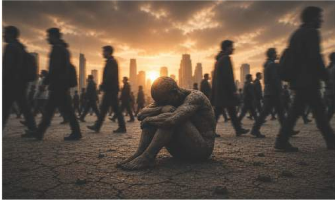
Disclaimer: This is an AI generated image.

However, tolerance or unity cannot exist or survive alone. In fact, no value or virtue can stand by itself. In the case of tolerance, there is either some common purpose that holds people in unity or an urgent common need waiting to be fulfilled that compels people to tolerate. Even then, tolerance