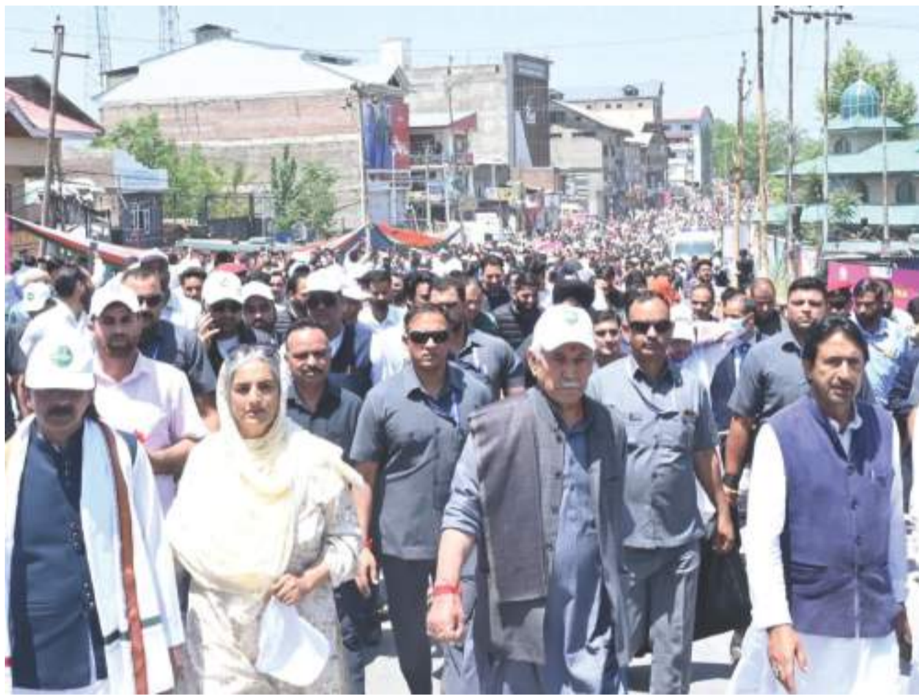
Lieutenant Governor Manoj Sinha leads Padyatra in Anantnag on Saturday as part of ‘Drug-Free J&K Campaign’

news agency—Kashmir News Observer (KNO) said, “Our neighbouring country is smuggling drugs into Jammu Kashmir by design. The drug money has been used to build narco-palaces by drug smugglers and a large portion of drug money is being used for terrorism and radicalization. While drugs are ruining the future of Jammu Kashmir’s youth on one hand, on the other, terror outfits are using that money to buy weapons and that are shedding the blood of our brothers and sisters in the UT.” The Lieutenant Governor joined Padyatra in Anantnag as part of “Drug-Free J&K Campaign” and walked with thousands of participants along the streets of the historic town. He said, “This narco-terror network has inflicted suffering on generations of Jammu Kashmir for decades. That is why I | More on P6