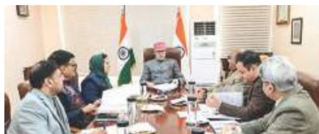
KT News Desk

Srinagar, May 14: The Council of Ministers headed by Chief Minister Omar Abdullah has accorded approval for the establishment of an 800 TPD Integrated Solid Waste Management (ISWM) Project at Achan, Srinagar, at an estimated cost of 361 crore. The decision was taken