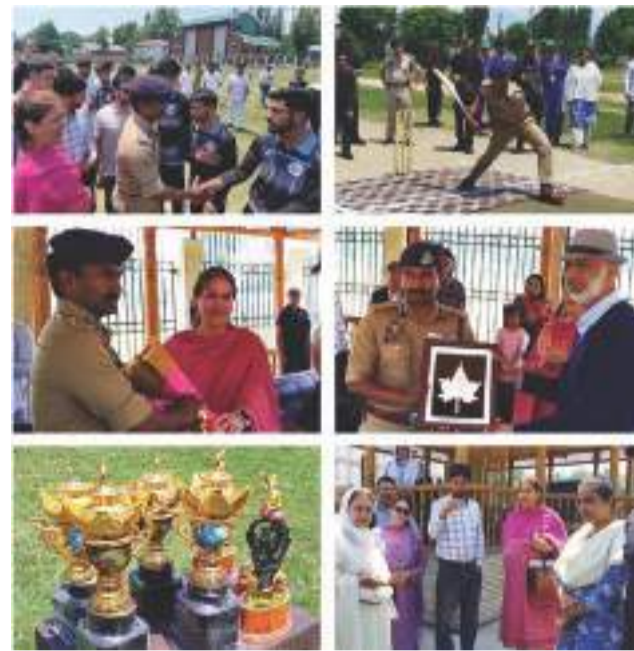
Government Degree Colleges have registered for the tournament, including nine men's teams and nine women's teams.

The participating men's teams include Government College of Education (IASE) Srinagar, GDC Hyderabad, Amar Singh College, GDC Bemina Srinagar, GDC Women M.A. Road Srinagar, S.P. College Srinagar, GDC Eidgah, Islamia College of Science and Commerce Srinagar, and Gandhi Memorial College Srinagar.