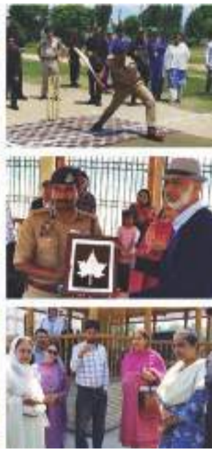
Islamia College of Science and Commerce Srinagar, and GC Women Nawa Kadal Srinagar.

The women's category included teams from GDC Zakura, Vishwa Bharati College, Amar Singh College, GDC Women M.A. Road Srinagar, S.P. College Srinagar, Gandhi Memorial College Srinagar,