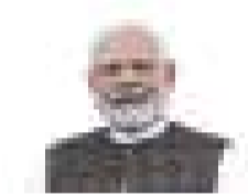
Narendra Modi (Prime Minister of India)

India's vision of putting humans at the centre of technology meets Italy's leadership in human-centric 'algor-ethics' rooted in its humanist tradition. AI must act as a catalyst for social empowerment. Technology cannot replace individuals or undermine their fundamental rights.