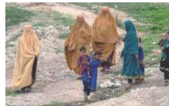
The photograph taken on March 3, 2025, shows Afghan refugees walking through a refugee camp in Islamabad.

The UN and NGOs are calling for $100.7 million