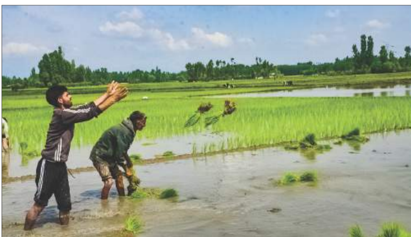
Farmers sow saplings in a paddy field in outskirts of Srinagar on Thursday.