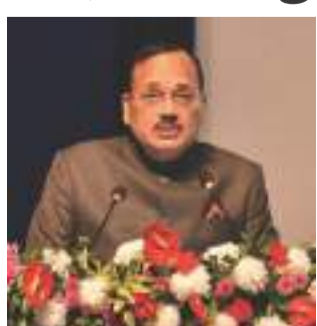
The CJJ, who was invited as the chief guest, could not attend the event and sent a video