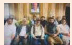
towards mounting debt, growers on | More on P6

Srinagar, May 23: Kashmir’s horticulture and agriculture sector has suffered nearly 30 percent damage due to repeated hailstorms across the Valley this year, leaving growers in deep financial distress and pushing many