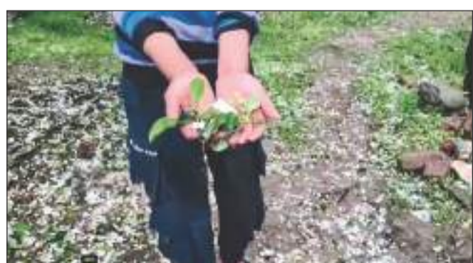
Rafiabad included Watergam, Hadipora and adjoining villages, where orchards turned

The growers told the news agency—Kashmir News Observer (KNO) that the hailstorm continued for several minutes with such intensity that developing apples began falling from trees instantly, while fruit-bearing branches suffered severe damage at a crucial stage of the fruit season. The worst-hit areas in