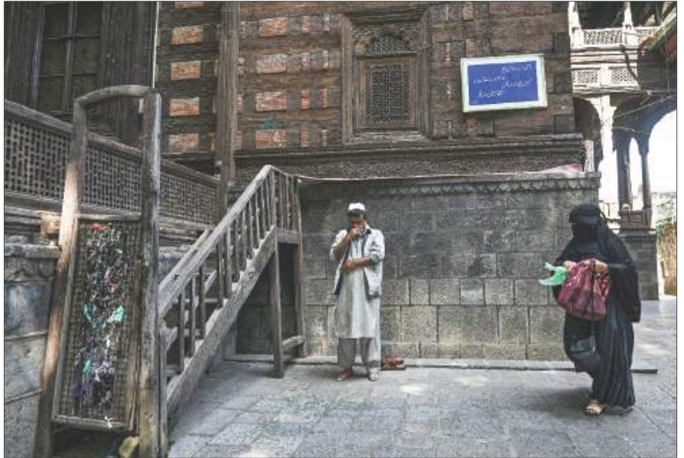
Man offering prayer at Khanqah-e-Moula shrine in old Srinagar on the Urs of Hazrat Mir Syed Ali Hamadani, popularly known in Kashmir as Shah-e-Hamadani (RA).

“It is now firmly etched in the minds of | More on P6