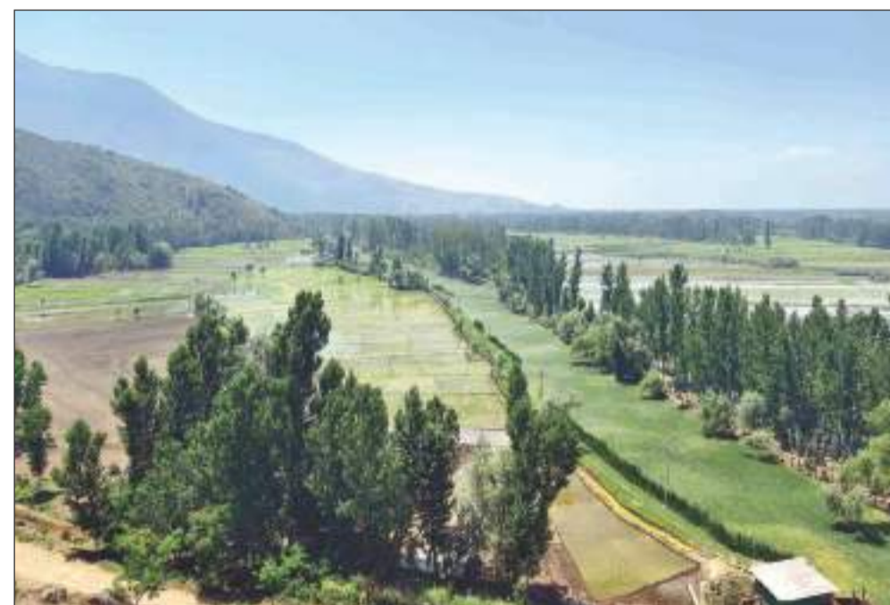
Lush green seedlings blanket fields of Bandipora in north Kashmir, showcasing region's vibrant agricultural beauty and promise of bountiful season ahead.

He observed that over the last nearly two months, citizens from all walks of life, have walked streets across the Union Territory, shared the pain of affected families, and energized our youth. "Our goal is to foster a grassroots resistance against drug abuse | More on P6