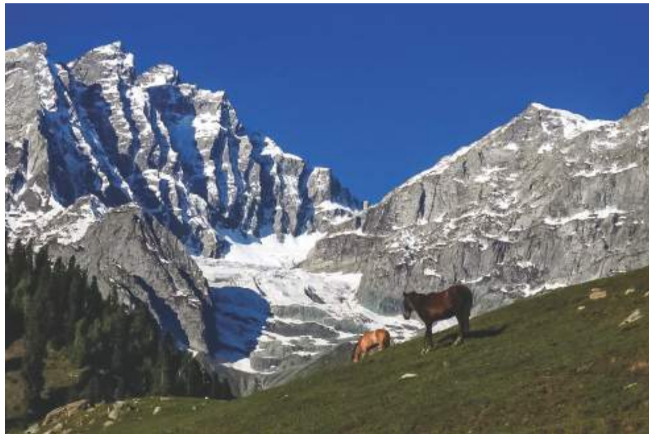
A view of majestic peaks and serene meadows at Sonamarg - a true paradise for nature lovers

He said, "As far as National Conference MPs are concerned, we | More on P6