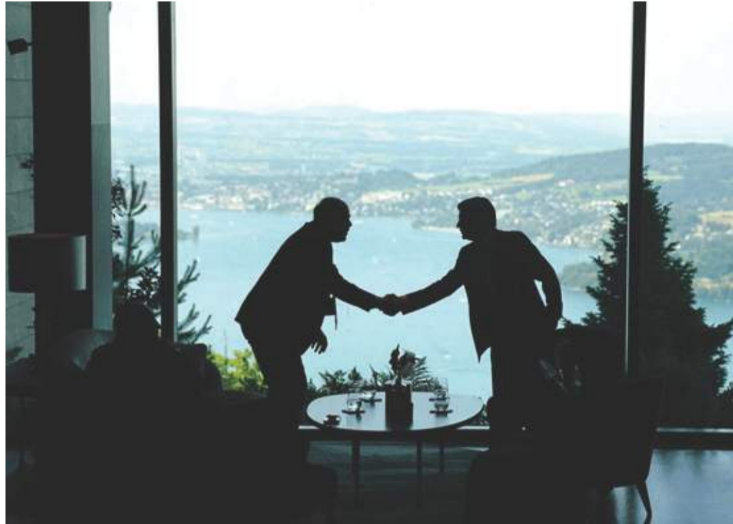
Delegation staff members meet in the lobby on the day of a quadrilateral meeting between the U.S., Iran, Pakistan, and Qatar at the Lake Lucerne Summit, aimed at advancing a deal to end the Middle East conflict, at Buergenstock Resort Lake Lucerne, near Stansstad, Switzerland, June 21, 2026.

In a post on social media, Iranian Foreign Minister Abbas Araqchi said his country had secured waivers for oil and petrochemical exports, the release of some frozen assets and the launch of a reconstruction and development plan for Iran. The White House had no immediate comment when asked if high-level talks had wrapped for now. Just before talks officially began on Sunday, Fox News reported that Trump said he told Iranian officials "you won't have a country" if they tried to close the strait again. Trump also reiterated an earlier threat that the U.S. would take over the waterway and possibly charge a toll of its own, Fox