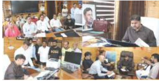
Dealers Association highlighted issues concerning the inter-state transportation of meat, including logistical and regulatory

Another deputation representing the J&K Wholesale Meat